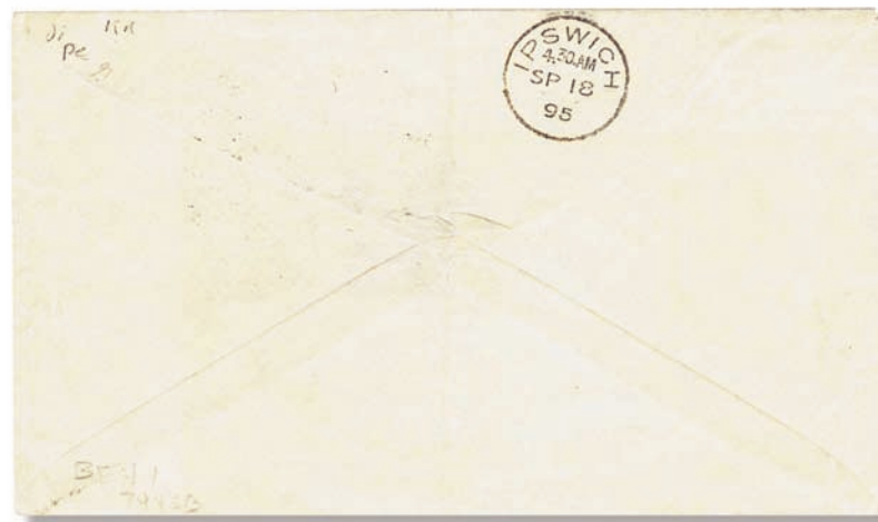
One of the covers that passed regular mail bearing a Clipperton stamp. It is cancelled San Francisco, September 3, 1895, and was sent to a well-known British stamp dealer at Ipswich.