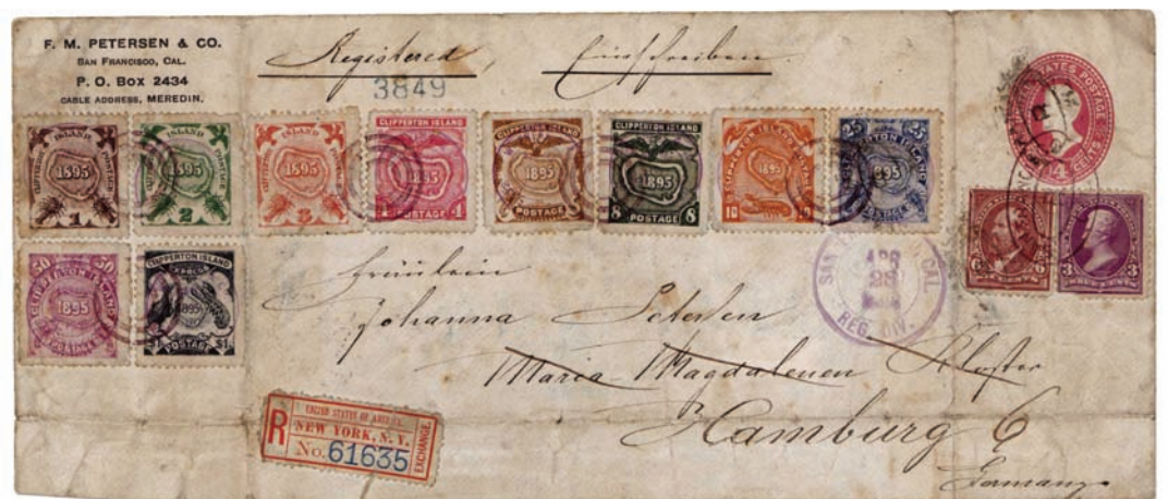
This spectacular cover, postmarked April 28, 1896, addressed to Germany and bearing a full set of Clipperton stamps, is the only witness that the stamps were also used by persons other than Frese.

Thus ends the story of the Clipperton stamps but this is not the end of Clipperton's philatelic history. In the first years of the 20th century Mexican stamps overprinted "Clipperton" turned up and a number of commemorative cancels between 1914 and 2005 were issued by various ships that visited the atoll during scientific expeditions. A mysterious "Clipperton research station" used an own cancel in 1966, and modern bogus issues also exist including French stamps overprinted "Ile Clipperton". All in all, ten distinctive postage stamps, six types of overprinted stamps/stationery from two foreign countries, at least fifteen different commemorative cancels, and two types of bogus stamps are known from Clipperton island – not bad for an almost forgotten place!